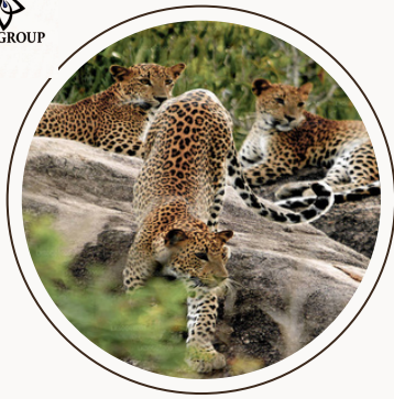
ELLA / YALA