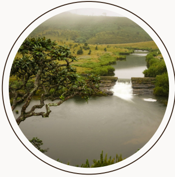
NUWARAELIYA / HORTAN PLAINS