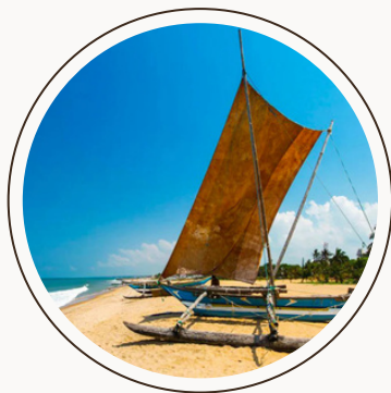
DAY 2: NEGOMBO