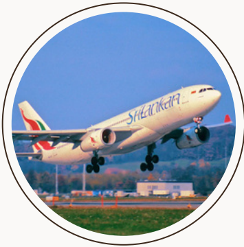
COLOMBO / DEPARTURE

Morning: Transfer to Bandaranaike International Airport