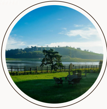
KANDY / NUWARAELIYA