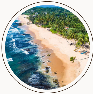
YALA / GALLE