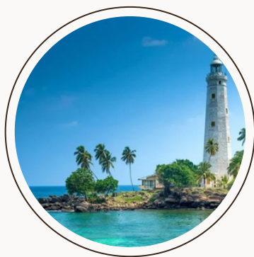
DAY 1: ARRIVEL / NEGOMBO