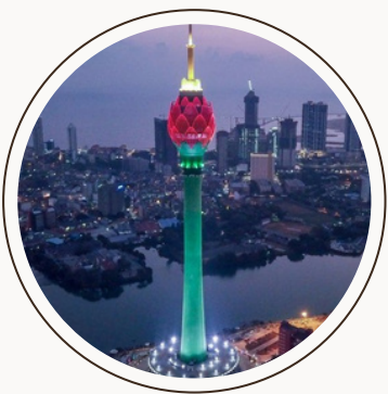
BENTOHATA / COMBO