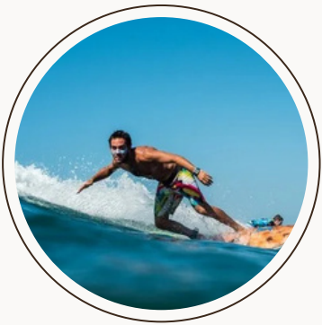
GALLE / BENTOTA