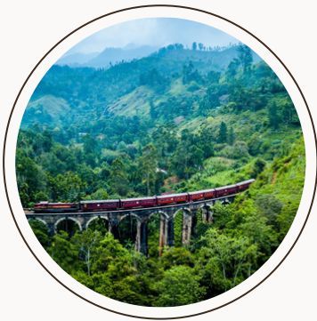
HORTAN PLAINS / ELLA